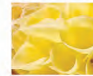
Sliced Potato 功夫土豆 30 sec

2-Person Meal: choose 5 | 4-Person Meal: choose 10