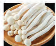
Seafood Mushroom 海鮮菇 1 min