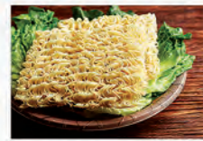
Instant Noodle 方便麵 3 mins

2-Person Meal: choose 2 | 4-Person Meal: choose 4