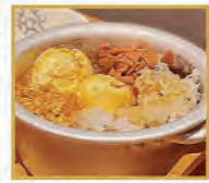
Oolong Jelly Ice Cream (For one or for four) 雪糕冰粉