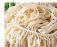
Beef Tripe (White) 牛百葉