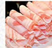
Pork Belly ★ 五花肉 2 mins