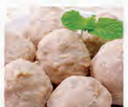
Pork Meatballs 6pc 貢丸