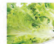
Green Lettuce 綠生菜 30 sec