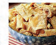
Dried Tofu Skin 腐竹 2 mins