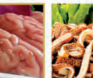
Lamb Tripe 草原羊肚 1 min