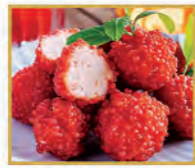
Crunchy Shrimp Ball 4pc 荔枝蝦球