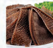
Beef Tripe 手撕黑毛肚 20 sec

2-Person Meal: choose 3 | 4-Person Meal: choose 6