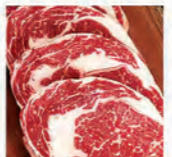
Angus Ribeye ★ 安格斯肋眼 1 min