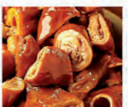
Braised Pork Intestine 滷水肥腸 2 mins