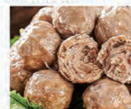
Beef Tendon Meatball 6pc 牛筋丸