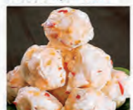
Lobster Balls 6pc 龍蝦丸 2 mins