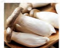
Mini King Mushroom 杏鮑菇 1 min