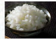
White Rice 白飯