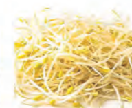
Soybean Sprouts 大豆芽