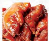
Braised Pig Feet 滷豬蹄 4pc 2 mins