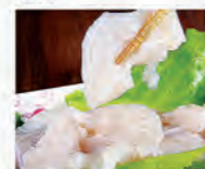
White Fish Fillet 8pc ★ 龍利魚 2 mins