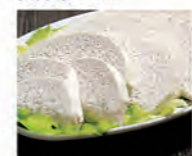
Taro Root 芋頭 4 mins