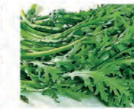
Tong Ho 茼蒿 1 min