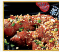
Roasted Pork Feet 4pc 脆皮豬蹄