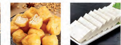
Puff Tofu 豆腐泡 2 mins