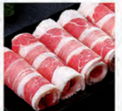
Beef Plate ★ 肥牛卷 30 sec