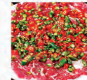
Double Layered Chili Beef ★ 雙椒牛肉 2 mins