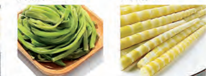
Tribute Dish 貢菜 3 mins