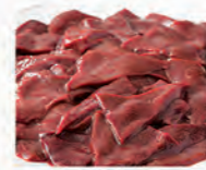
Pork Liver 豬肝