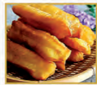
Chinese Fried Dough 酥炸油條