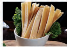
Sweet Potato Noodle 川粉 3 mins