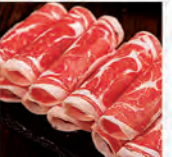
Lamb Shoulder ★ 羊肩肉