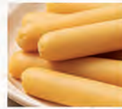
Mini Cheese Fish Sausage 迷你芝士魚香腸

2-Person Meal: choose 4 | 4-Person Meal: choose 8