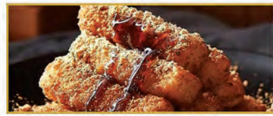
Brown Sugar Rice Cake 4pc 紅糖糍粑

2-Person Meal: choose 1 | 4-Person Meal: choose 2