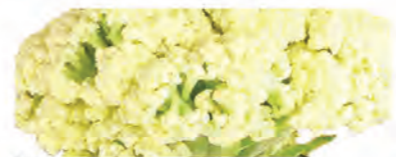
Chinese Cauliflower 台山花椰菜