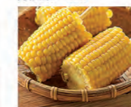
Sweet Corn 玉米 3 mins