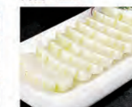
Winter Melon 冬瓜 3 mins