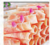
Chicken Breast ★ 雞胸肉 1 min