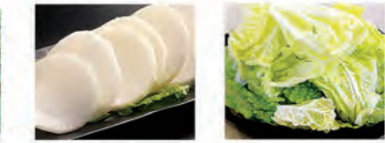
Radish 白蘿蔔 3 mins