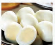
Quail Egg 鵪鶉蛋 2 mins