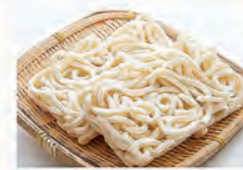
Udon Noodle 烏冬麵 2 mins