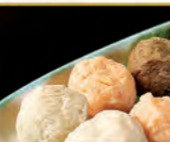
Mix Ball Combo 6pc ★ 丸子拼盤 2 mins Pork Meatballs, Lobster Balls, Cuttlefish Balls, Beef Tendon Meatball, Salted Egg York Shrimp Balls, 貢丸, 龍蝦丸, 牛筋丸, 鹹蛋黃蝦丸, 墨魚丸