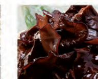
Black Fungus 黑木耳 1 min