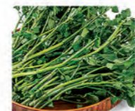
Watercress 西洋菜 1 min