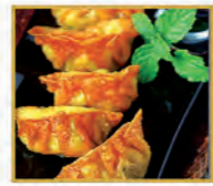
Pork Dumpling 4pc 炸肉餃