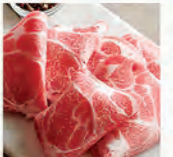
Pork ★ 梅花豬肉 2 mins