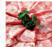
Beef Tongue ★ 極品牛舌 20 sec