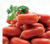
Mini Sausage 迷你香腸 1 min