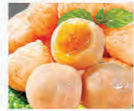
Salted Egg York Shrimp Ball 鹹蛋黃蝦丸 6pc 3 mins