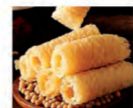
Bean Curd Roll 三秒響鈴 10 sec