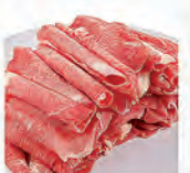
Beef Brisket ★ 牛胸肉