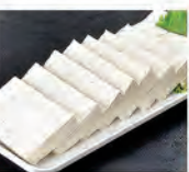
Fresh Tofu 鮮豆腐 1 min