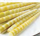
Bamboo Shoots 高山筍尖 3 mins