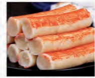
Imitation Crab Meat 蟹肉棒 6pc 2 mins