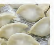
Pork Dumpling 4pc 豬肉餃子 1 min