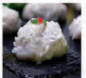
Handmade Shrimp Paste 手打蝦滑 2 mins ★