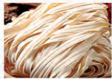
Knife Cut Noodle 刀削麵 4 mins