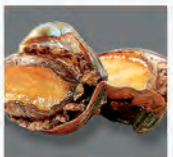
Abalone 4pc ★ 鮑魚 4 mins