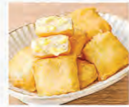
Cheese Fish Tofu 6pc 芝士魚豆腐 2 mins