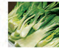
Bok Choy 青菜 1 min