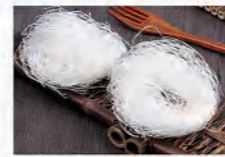
Vermicelli 粉絲 1 min