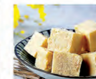
Frozen Tofu 凍豆腐 3 mins