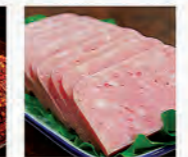
Spam 午餐肉 1 min