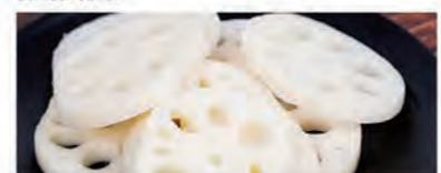
Lotus Root 蓮藕 3 mins