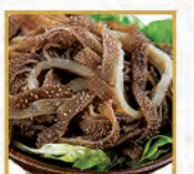
Layered Beef Tripe OX Artery ★ 千層肚 20 sec