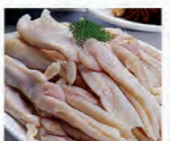
Boneless Duck Feet 6pc 無骨鴨掌 3 mins