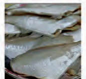
Leather Jacket Fish ★ 重慶耗兒魚 3 mins