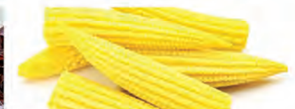
Baby Corn 玉米筍 1 min