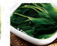
Seaweed Sprout 海帶苗 1 min