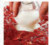
Milky Beef ★ 拔罐牛肉 3 mins