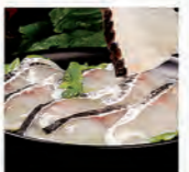
Snakehead Fish Fillet 功夫黑魚片 1 min ★