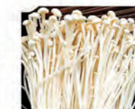
Enoki Mushroom 金針菇 1 min