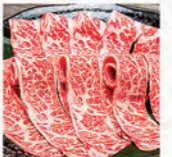
Boneless Short Rib ★ 精選牛小排 30 sec