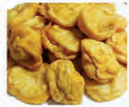
Fish Curd 6pc 魚腐 1 min ★