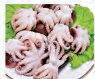
Baby Octopus 4pc 小章魚 2 mins