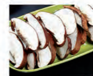
Shiitake Mushroom 鮮香菇 1 min