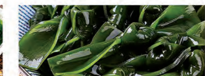
Seaweed Knot 海帶結 2 mins