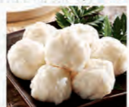
Cuttlefish Balls 6pc 花枝丸 2 mins