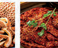
Mala Beef ★ 麻辣牛肉 3 mins