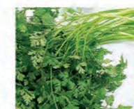
Cilantro 香菜 1 min