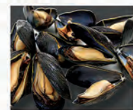
Mussels 5pc ★ 青口 2 mins