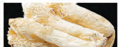
Bamboo Fungus 竹筴 1 min