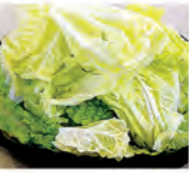
Napa Cabbage 大白菜 1 min